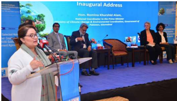
Coordinator to the Prime Minister on Climate Change, Romina Khurshid Alam addressing an event on Green Industrialization Project in Islamabad on 26-02-2025.

ISLAMABAD: (February 26, 2025) – Romina Khurshid Alam, Coordinator to the Prime Minister on Climate Change, highlighted Pakistan's commitment to advancing its green industrialization agenda to achieve climate resilience and meet environmental goals.