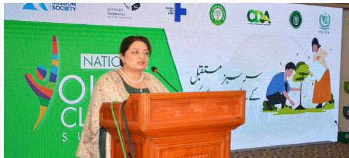
Coordinator to the Prime Minister for Climate Change, Romina Khurshid Alam, addressing the National Youth Climate Summit in Islamabad on January 28, 2025.

ISLAMABAD (January 28, 2025) – Romina Khurshid Alam, Coordinator to the Prime Minister for Climate Change, praised the pivotal role of youth in driving global and national climate action at the National Youth Climate Summit.