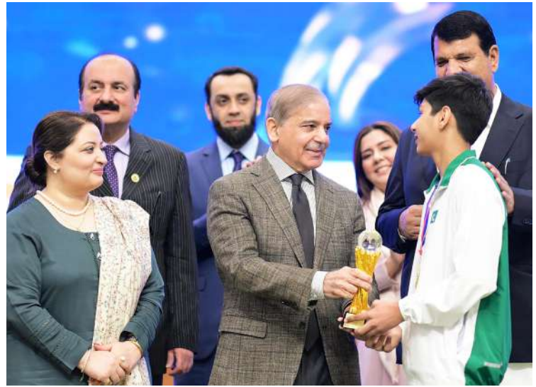
Prime Minister Muhammad Shehbaz Sharif presents Climate Champions Awards to the Youth who have positively contributed towards the preservation of climate, at the CAYA conference in Islamabad on January 28, 2025.

Let us work together to protect our wetlands, protect our future.