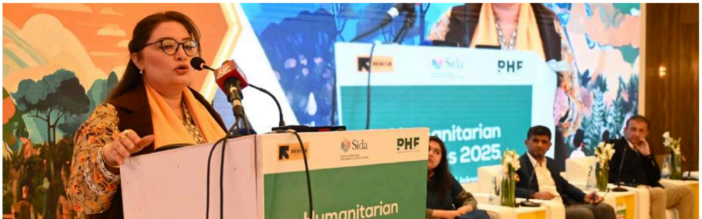
Coordinator to PM for Climate Change, Romina Khurshid Alam addressing a seminar titled "Humanitarian Futures" in Islamabad on 16-01-2025

The PM's climate aide also underscored the importance of incorporating disaster risk financing into the global loss and damage agenda. She stated that this approach signifies a proactive measure to manage the rising costs linked to climate change.