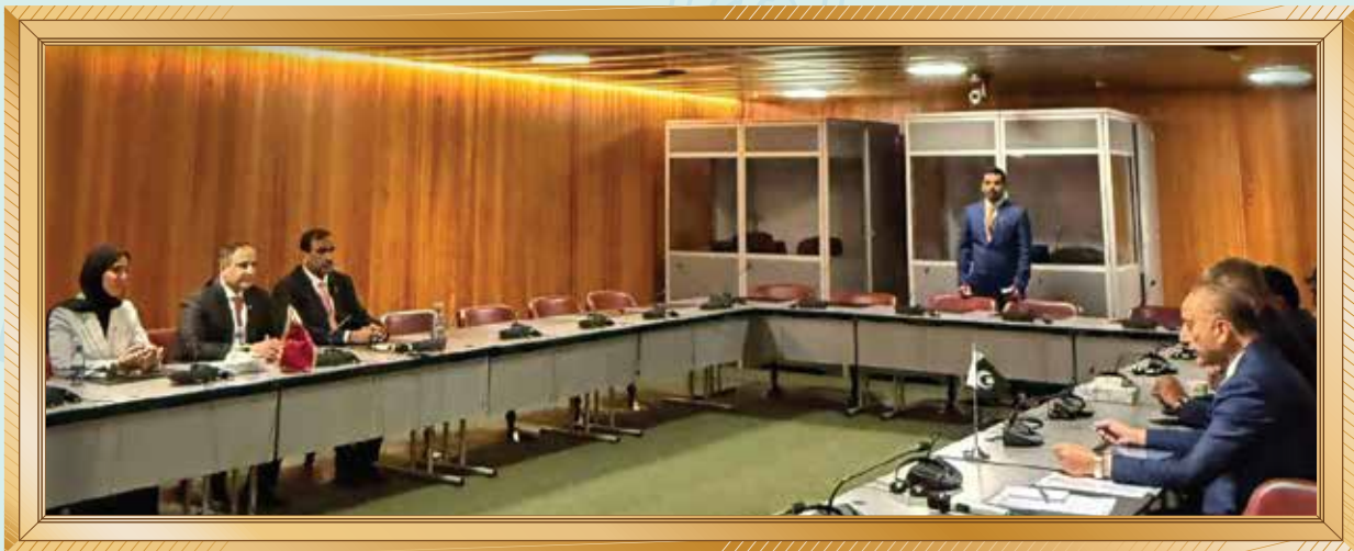
Minister of Environment and Climate Change of Qatar Dr. Abdullah bin Abdulaziz calls on Federal Minister on Climate Change and Environmental Coordination, Senator Musadik Malik on the sidelines of the Conferences of the Parties to the Basel, Rotterdam and Stockholm Conventions being held in Geneva, Switzerland from April 29 to May 2, 2025.