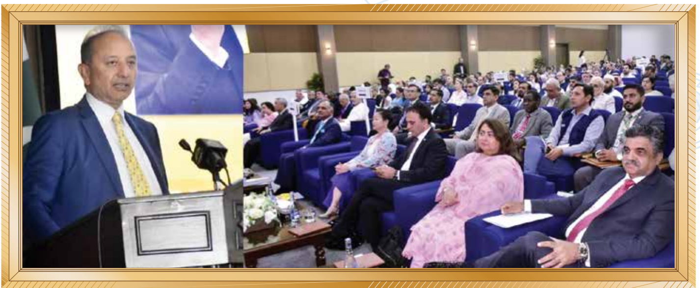
Federal Minister for Climate Change Dr. Musadiq Malik addresses PEDRR-25 in Islamabad on May 6, 2025 - Calls for climate justice, disaster preparedness, and global cooperation.

ISLAMABAD (May 6, 2025) – The Federal Minister for Climate Change and Environmental Coordination Dr. Musadiq Malik inaugurated the 2nd Pakistan Expo on Disaster Risk Reduction (PEDRR-25), organized by the National Disaster Management Authority (NDMA), reaffirming the nation's strong commitment to disaster preparedness and climate resilience.