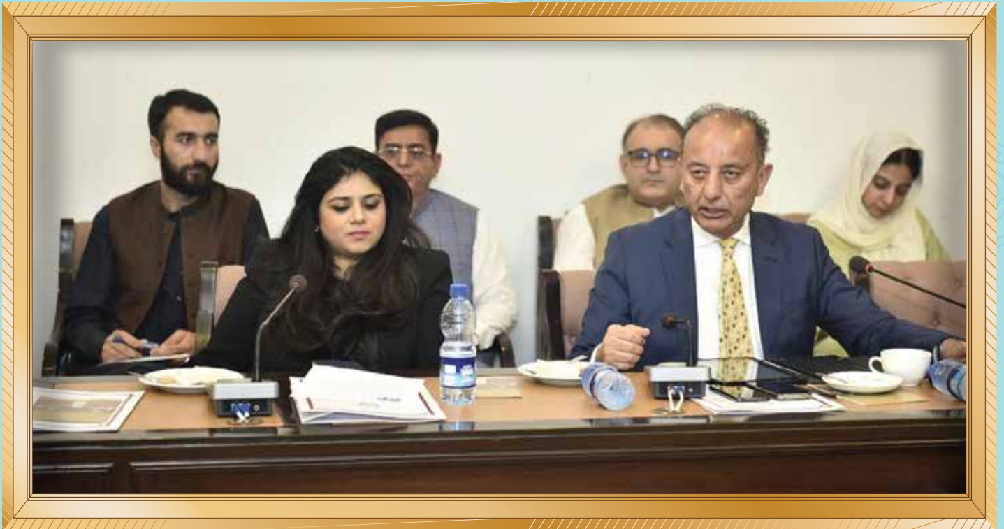
Federal Minister Dr. Musadik Malik, participated in a panel session titled "Dialogue, Not Discord: Conflict Resolution, Diplomacy, & the Rule of Law in U.S. - Pakistan Relations" at the Pakistan Institute for Parliamentary Services (PIPS), Islamabad on May 24, 2025.

ISLAMABAD (May 24, 2025) - Federal Minister for Climate Change Dr. Musadik Malik on Saturday reaffirmed Pakistan's dedication to peaceful conflict resolution during a panel discussion at the Pakistan Institute for Parliamentary Services (PIPS).