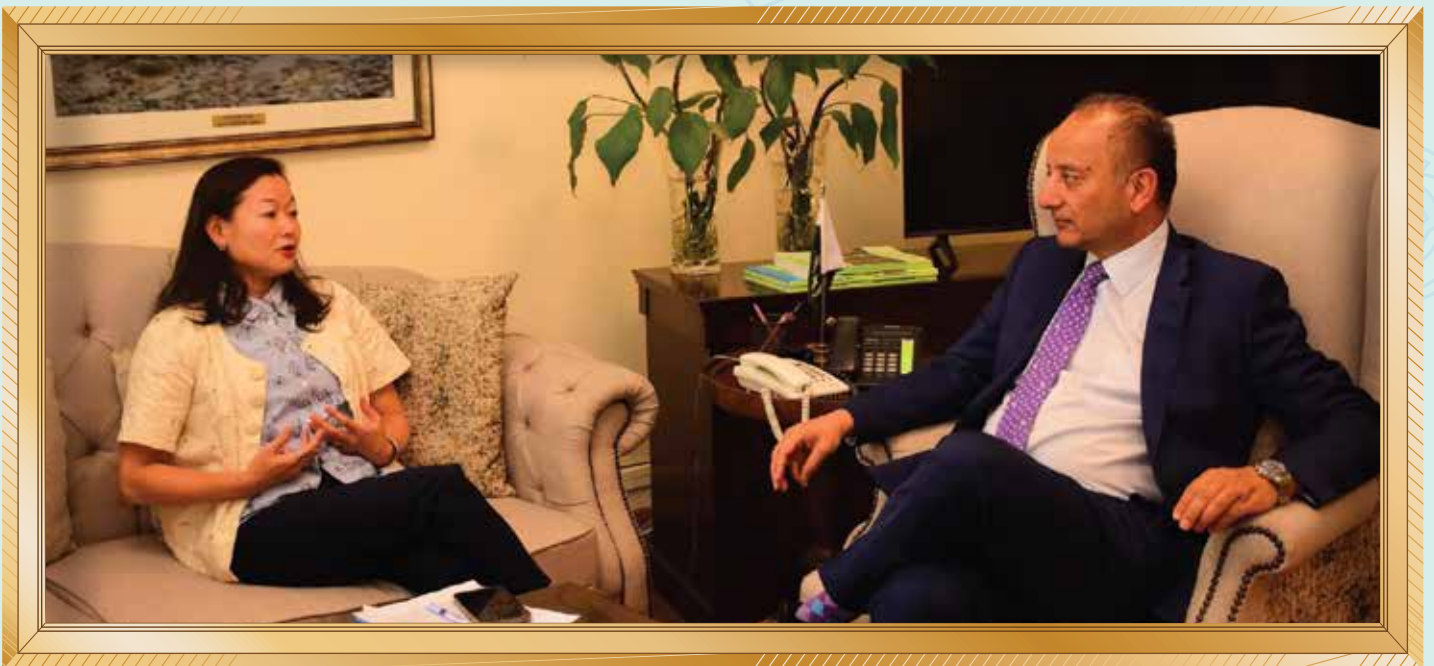
Federal Minister for Climate Change and Environmental Coordination, Dr. Musadik Malik, met with Ms. Coco Ushiyama, Country Director of the United Nations World Food Programme (WFP). On May 30, 2025

ISLAMABAD (May 30, 2025) — The Government of Pakistan and the United Nations World Food Programme (WFP) have reaffirmed their commitment to joint climate-resilient ventures aimed at addressing food insecurity and malnutrition in vulnerable regions of the country