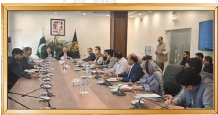
Minister for Climate Change and Environmental Coordination Dr. Musadik Malik and Minister for Water Resources Mr. Muhammad Moeen Wadoo co-chair a meeting of the Task Force on Water Scarcity and its Impact on Rabi and Kharif Crops held in the M/o Climate Change & Environmental Coordination in Islamabad on May 15, 2025.

ISLAMABAD (May 15, 2025) — The federal government has set up a high-level task force to address worsening water scarcity and its impact on the Rabi and Kharif crops.